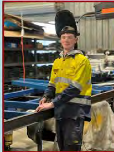
Jarome Engineering - Fabrication with Ballarat Isuzu

Congratulations on successfully getting a School Based Apprenticeship